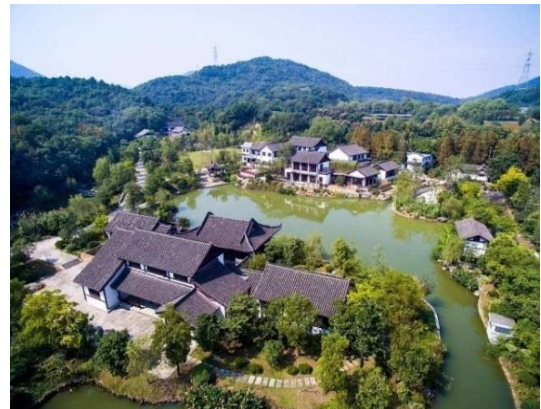
Yuhuang Shannan, Hangzhou